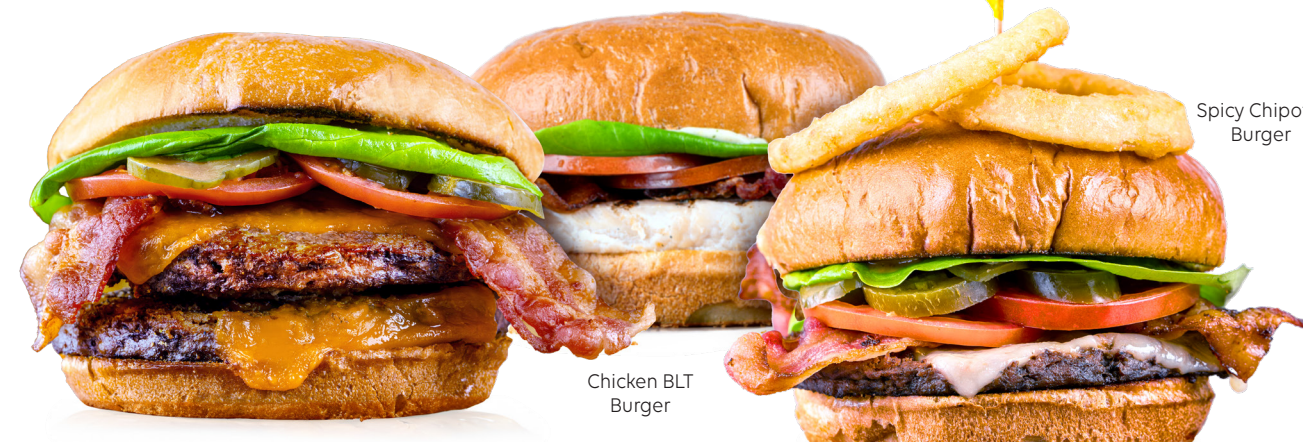
Bacon Double Cheeseburger

Lightly battered haddock topped with melted cheddar, lettuce, tomato, pickles and tartar sauce. Served with fries and coleslaw.