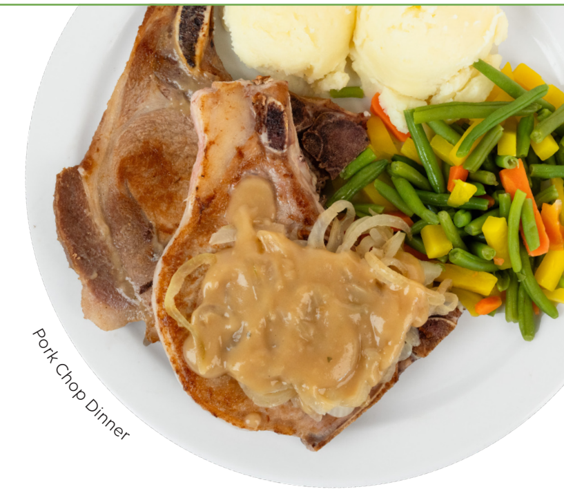
Pork Chop Dinner