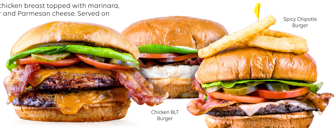
Bacon Double Cheeseburger

Oven-baked, crispy chicken breast topped with marinara, mozzarella, cheddar and Parmesan cheese. Served on penne.