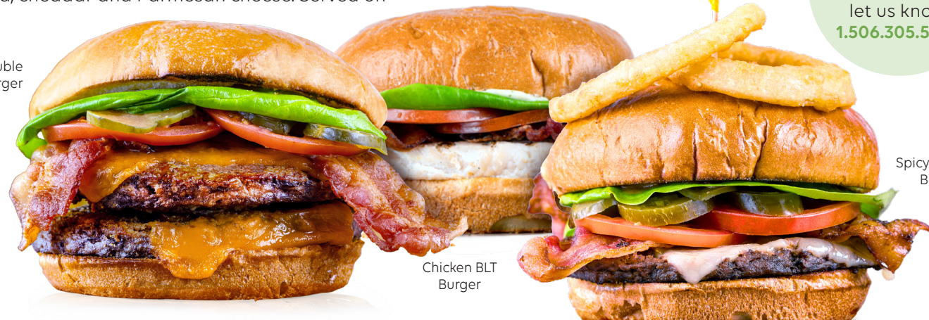
Chicken BLT Burger