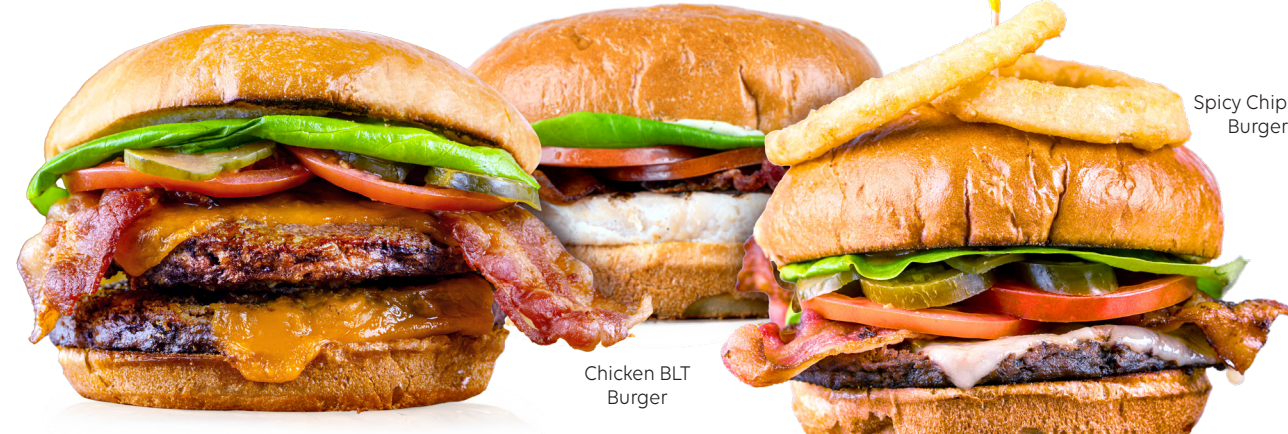
Bacon Double Cheeseburger

Lightly battered haddock topped with melted cheddar, lettuce, tomato, pickles and tartar sauce. Served with fries and coleslaw.