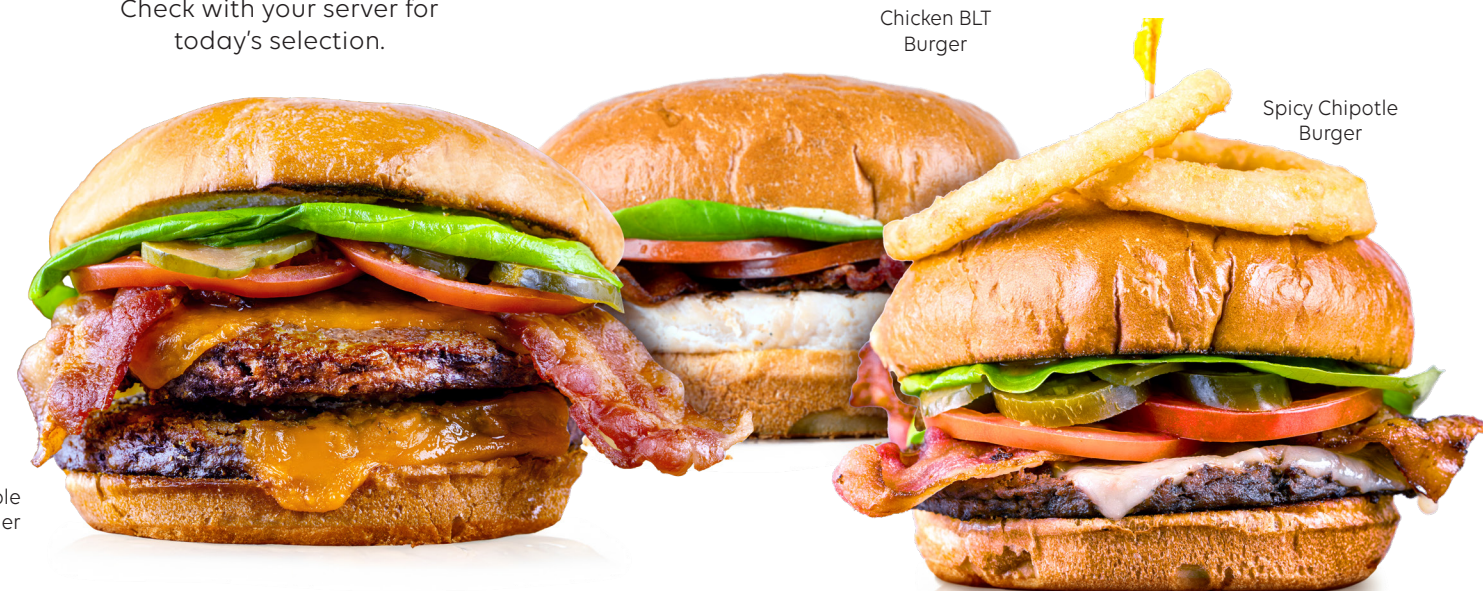
Chicken BLT Burger