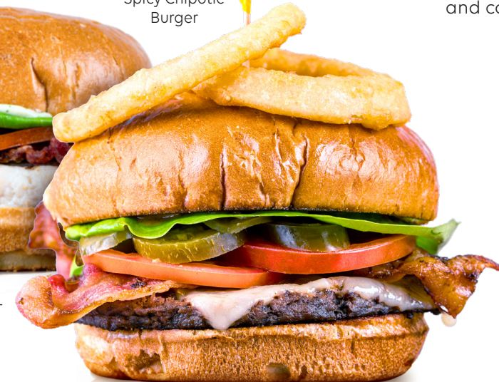
Spicy Chipotle Burger