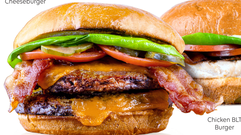
Chicken BLT Burger