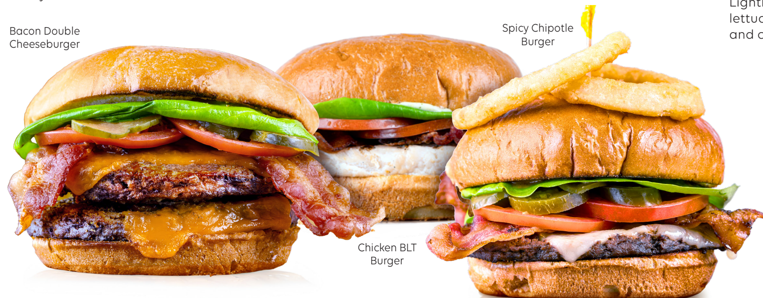
Bacon Double Cheeseburger