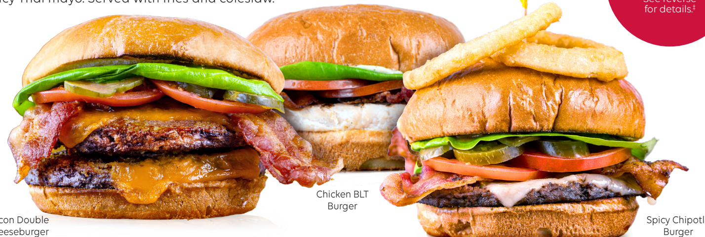
Bacon Double Cheeseburger

You can get a FREE slice with Hometown Rewards. See reverse for details.*