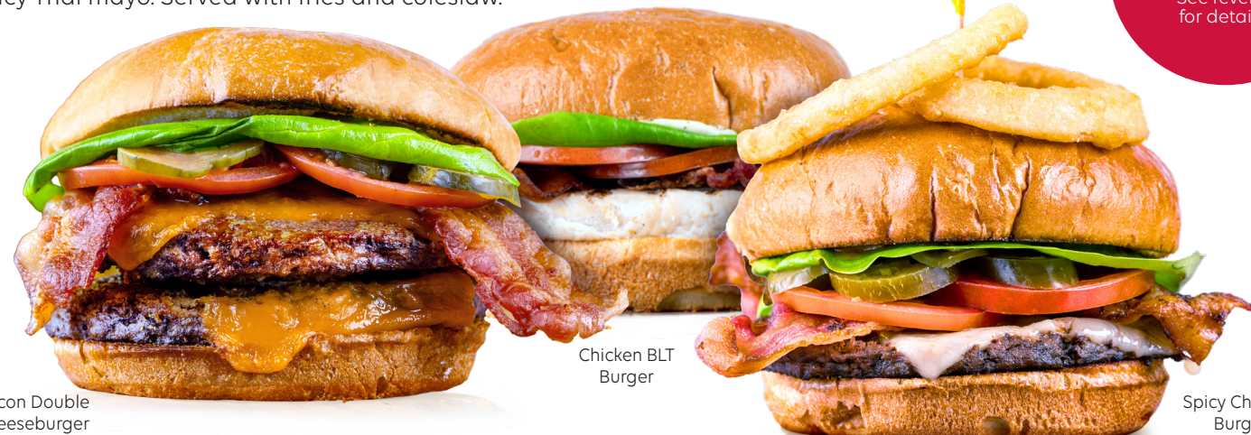
Bacon Double Cheeseburger

You can get a FREE slice with Hometown Rewards See reverse for details.*