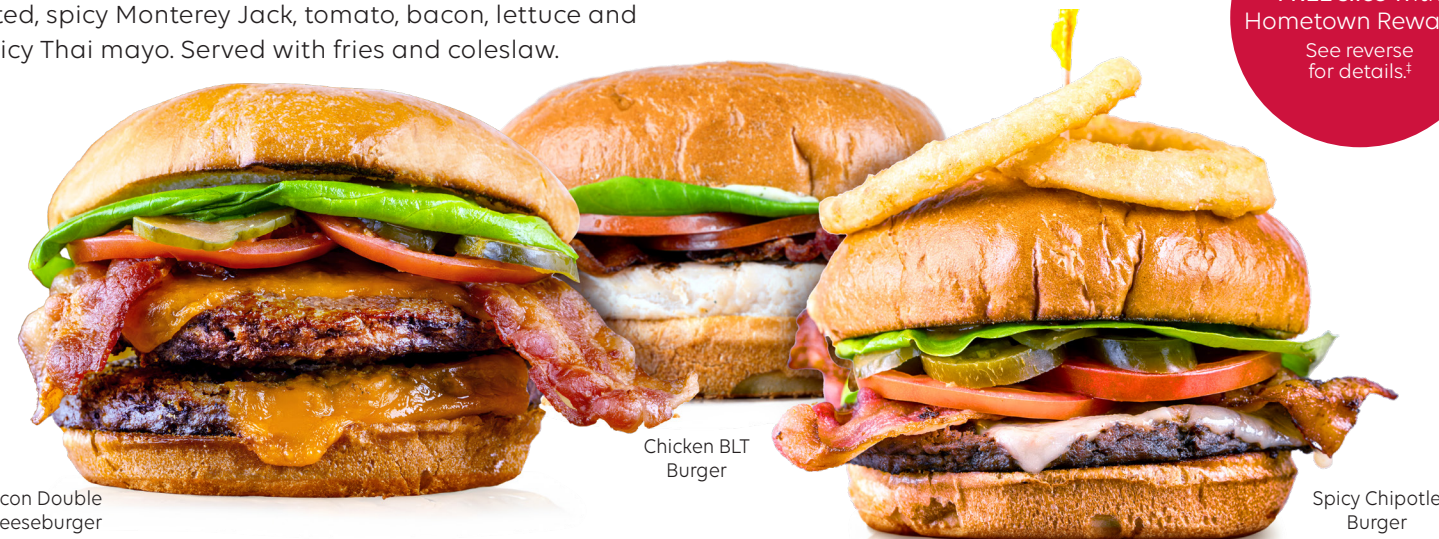
Bacon Double Cheeseburger

You can get a FREE slice with Hometown Rewards. See reverse for details.†